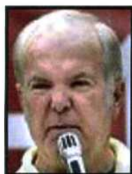
Former Governor Booth Gardner campaigns for I-1000

Ten years after the Oregon Death with Dignity Act went into effect – surviving all legal challenges – the voters of its neighboring state overwhelmingly passed I-1000 – the Washington Death with Dignity law. Essentially the same as the Oregon law it provides physician aid in dying –in the form of a prescription for a lethal medication– to mentally competent, terminal ill adult residents of Washington following a 15 day waiting period, two oral and one written request and a possible mental health examination. The initiative garnered 59% of the vote – more than Barack Obama received in that state. The law will go into effect in March, 2009, despite continuing strong opposition of the Catholic Church. Governor Gardner, who is suffering from advanced Parkinson's Disease, campaigned for the law although he may not be able to use it since Parkinson's is not considered terminal. Jurisdictions where medically assisted dying is legal now include Oregon, Washington, the Netherlands, Belgium, Switzerland and Luxembourg.