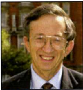
Lord Joel Joffe

Canada Dying With Dignity and the World Federation of Right to Die Societies are excited to announce pre-registration for the September 7-10, 2006 conference. Register before June 30 and you'll be entered into a draw to receive your registration free!